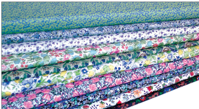
The clothing segment has gained prominence since the 1970s

industry spread across the country. Its growth rate has almost doubled over the last eight years and the knitted segment has grown faster than woven garments. The estimated production of this industry is about 8000 million pieces.