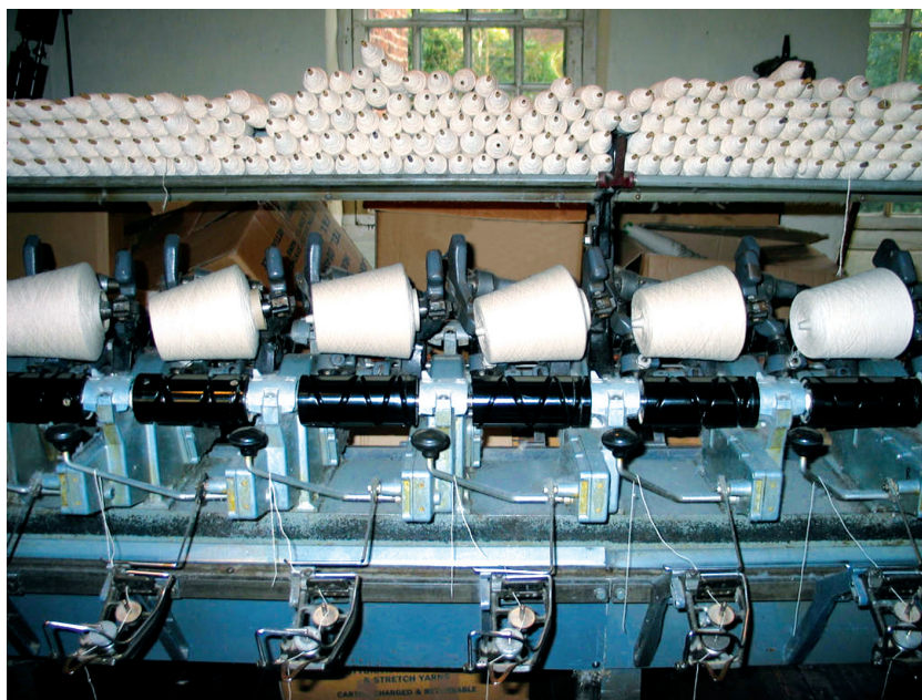
India lags much behind China in capacity build-up